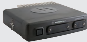
EXPANSION HEAD ENHANCED STD AND AUXILIARY 25 PIN AND RS232