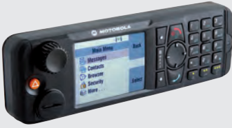
REMOTE ETHERNET CONTROL HEAD (ReCH) SUPPORTS EXTERNAL SPEAKERS AND PTT