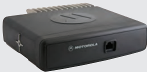
EXPANSION HEAD SINGLE STD CONNECTION