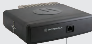
IP67 MOUNT BOAT, MOTORCYCLE