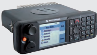
STANDARD CONTROL HEAD