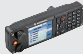
IP67 CONTROL HEAD