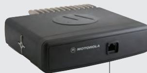
REMOTE HEAD MOUNT CAR, AMBULANCE, FIRE TRUCK