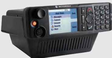
DESK MOUNT CONTROL CENTRE