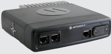
ETHERNET EXPANSION HEAD 2X STD, ETHERNET TYPE, ETHERNET SIM READER AND RS232