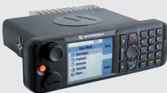
DASH MOUNT CAR, TRUCK