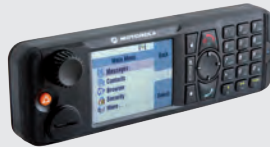
REMOTE CONTROL HEAD